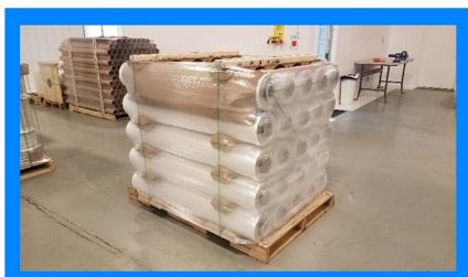
Cradle or Custom, No Standard