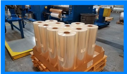
Pack 9.5" OD – 13 Rolls to a Layer

There are three types of packaging: Pancake, Cradle, & Header. Pallets: 43" x 43" - Avg. Height is between 38" to 45".