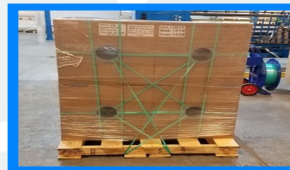
Header Pack – 6" Cores - 22.5" OD - one to four rolls per pallet depending on width and pallet