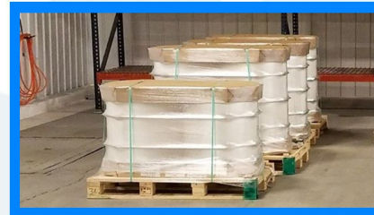
Pallets: 30" x 52" – Pack 24" OD – 2 Rolls to a Layer