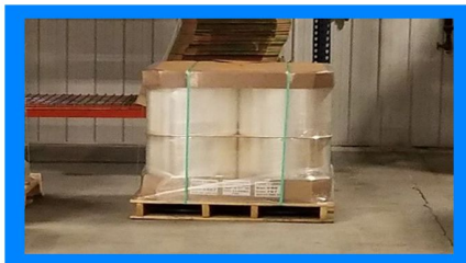
Pack 18" OD – 4 Rolls to a Layer