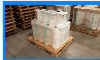
Cradle or Custom, No Standard