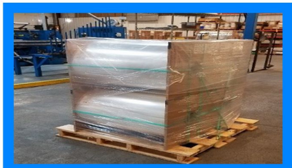
Header Pack – 6" Cores - 22.5" OD - one to four rolls per pallet depending on width and pallet