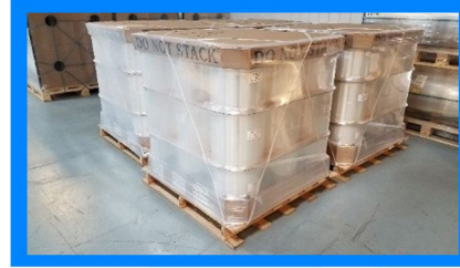
Pack 13" OD – 9 Rolls to a Layer